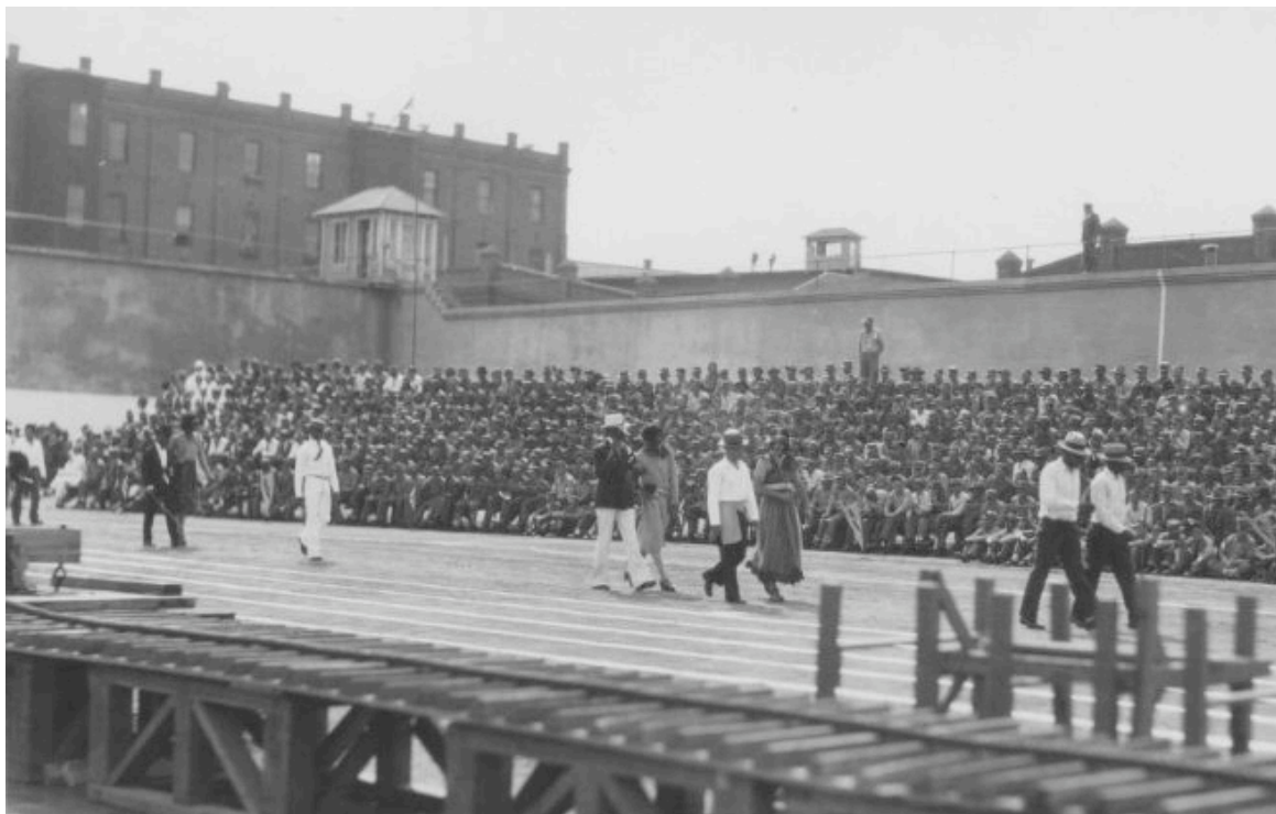
Parade of prisoners, some in female dress, San Quentin Little Olympics Field Meet, 1930.

It is also important to be aware that legal action—anything from a 602 grievance to a formal litigation with an attorney—can bring about guard retaliation. This is unlawful. However, as you may already know, that does not stop it from occurring. Only you can know what is best for you in your situation. It can be a good idea to let family and attorneys know that you are pursuing claims so that they can be vigilant in keeping in contact with you. You may already know this, but TGI Justice members have seen that sometimes having people visit you or write to you can reduce the amount of abuse or retaliation you experience. Pen pals and visitors let prison officials know that people are taking note of what happens to you.