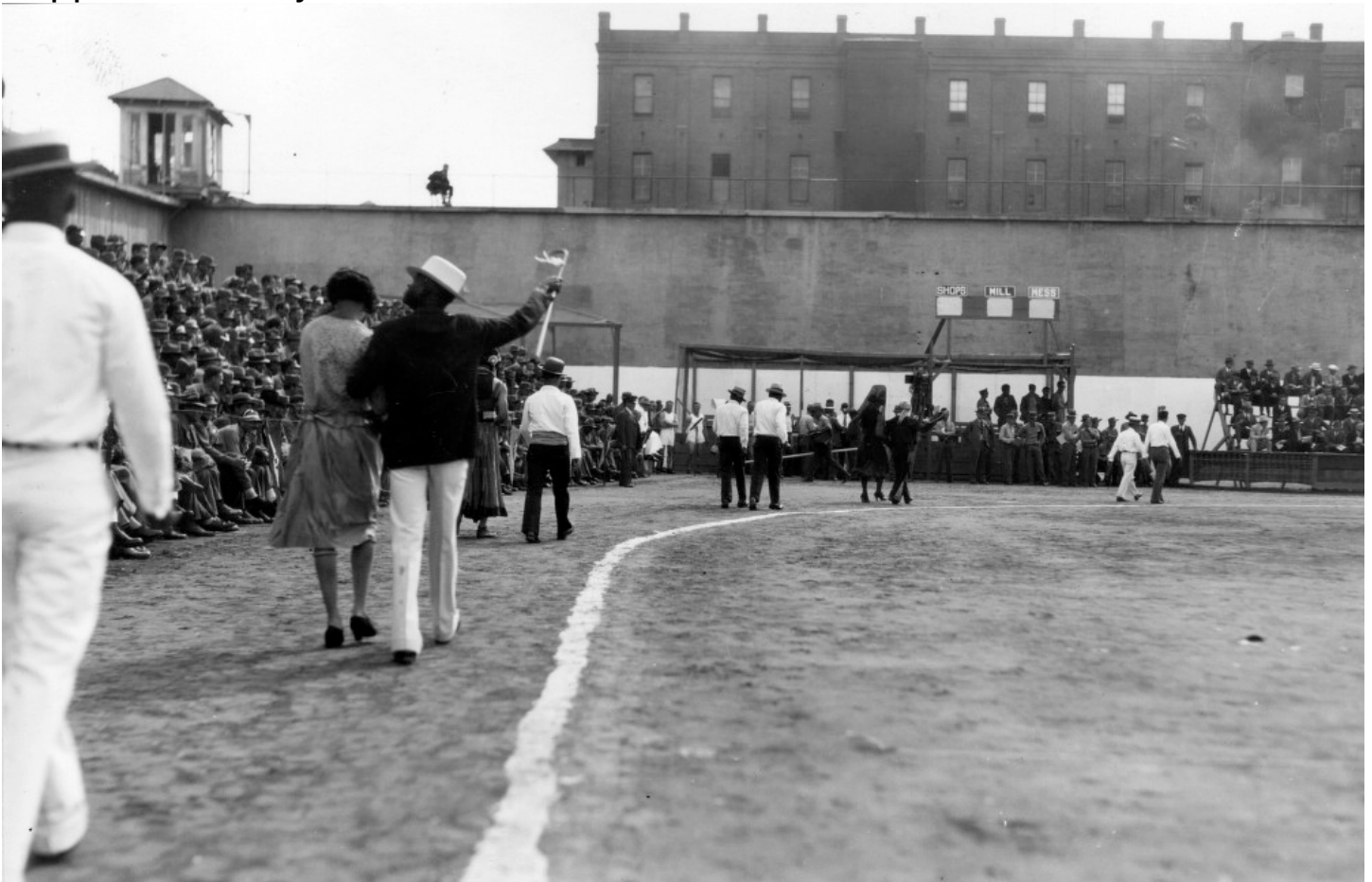
Parade of prisoners, some in female dress, with prison buildings in background, San Quentin Little Olympics Field Meet, 1930.

classism, specifically within the Prison Industrial Complex (PIC). PARC believes in building strategies and tactics that build safety in our communities without reliance on the police or the PIC. We produce a directory that is free to prisoners upon request, and seek to work in solidarity with prisoners, ex-prisoners, their friends and families. We also work with teachers and activists on many prison issues. This work includes building action networks and materials that expose the continuing neglect and outright torture of more than 2 million people imprisoned within the USA, as well as the 5+ million who are under some form of surveillance and control by the so-called justice system. Ask for their Annual Prisoner Support Directory.