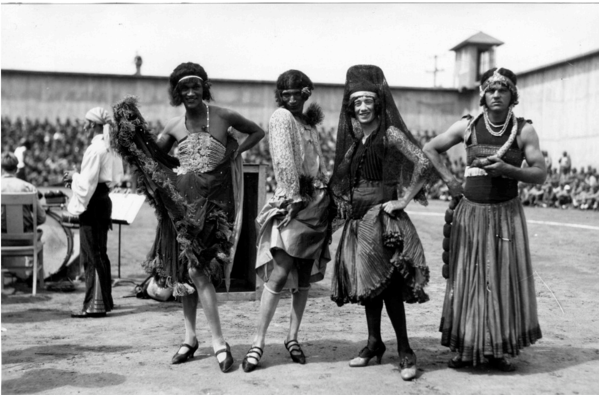
Stage entertainment, San Quentin Little Olympics Field Meet, 1930.