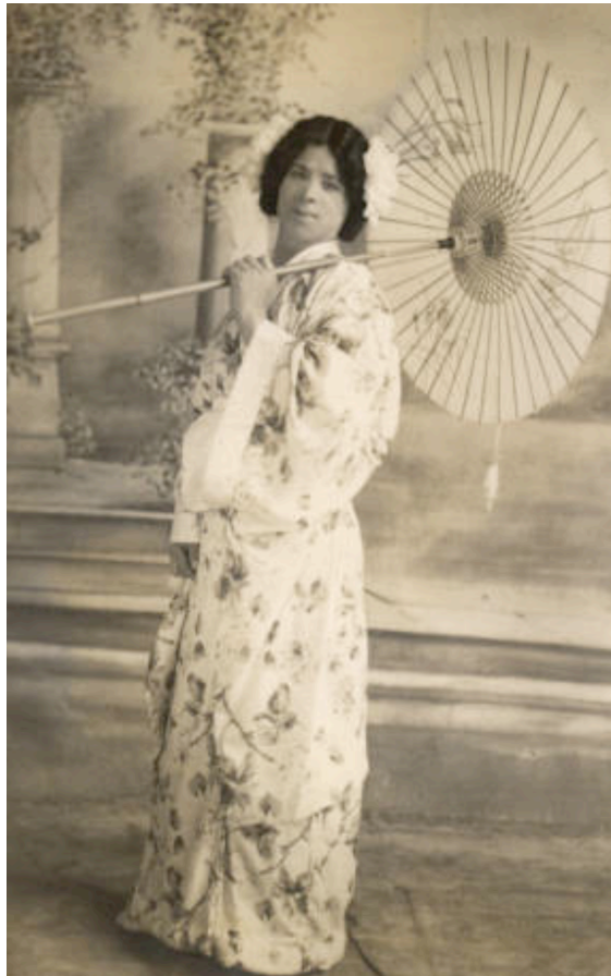
Female impersonator in Japanese clothes at San Quentin State Prison, circa 1915.